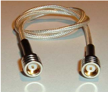
#RTM-CSMAP561-18 (Tensolite #561 .085 type 18 inches)